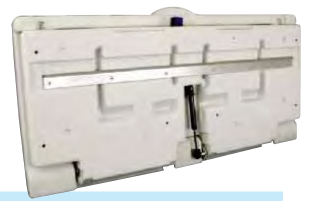
Options: EZH EZ Mount backer plate for EH2-FR EZV EZ Mount backer plate for EV2-FR

EZ Mount<sup>™</sup> Backer Plate has been designed for the EH2-FR & EV2-FR units. It is an optional, but unique design which enables the unit to be installed easily, with only one person.